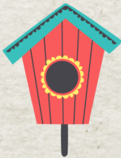
Bird Feeders & Houses