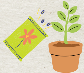
Seed Packets & Plants