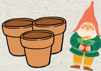
Pots & Garden Decor