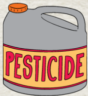
Chemicals/ Fertilizers/ Pesticides/ Weed Killer